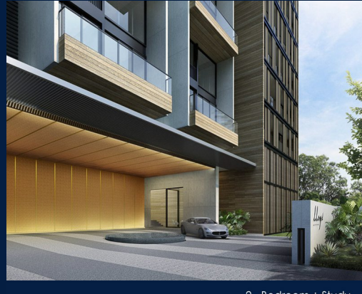
2 - Bedroom + Study