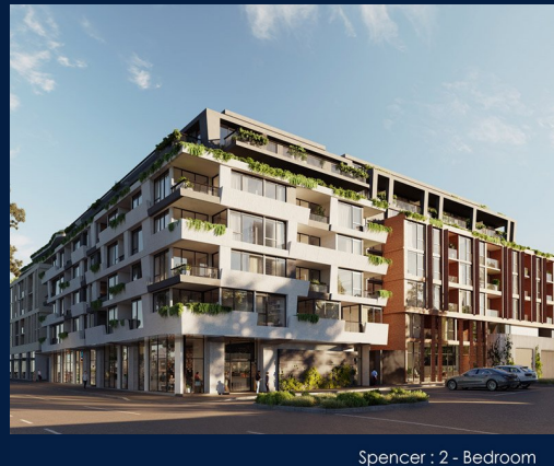
SP-701 130 vgf